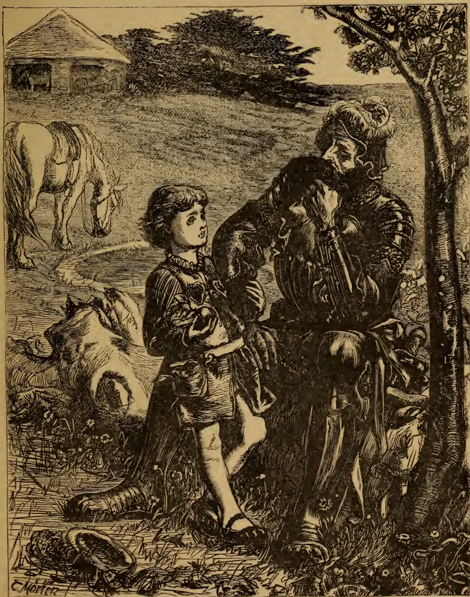
LIFE AND DEATH.